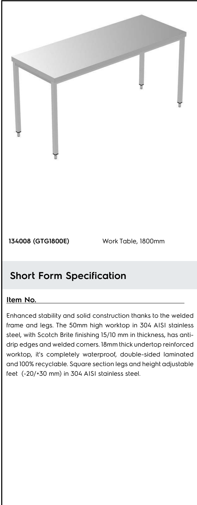
134008 (GTG1800E) Work Table, 1800mm